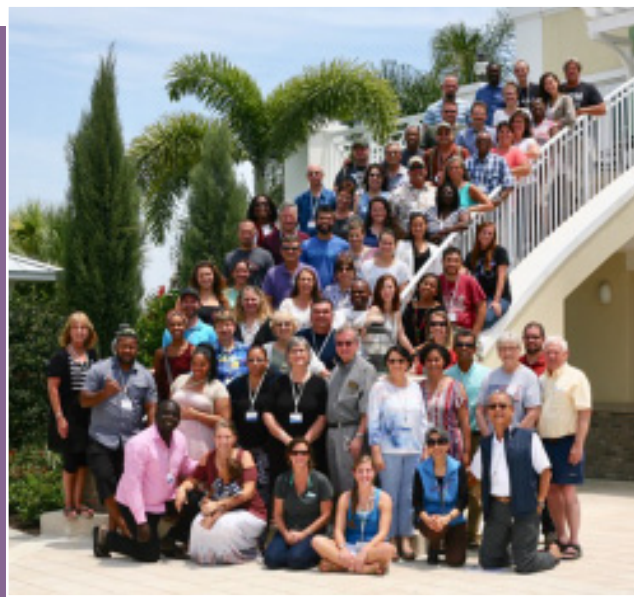
65 Ministry leaders from the Caribbean.

"from that week I have been faithfully exercising and guarding my time commitments and I feel so much better."